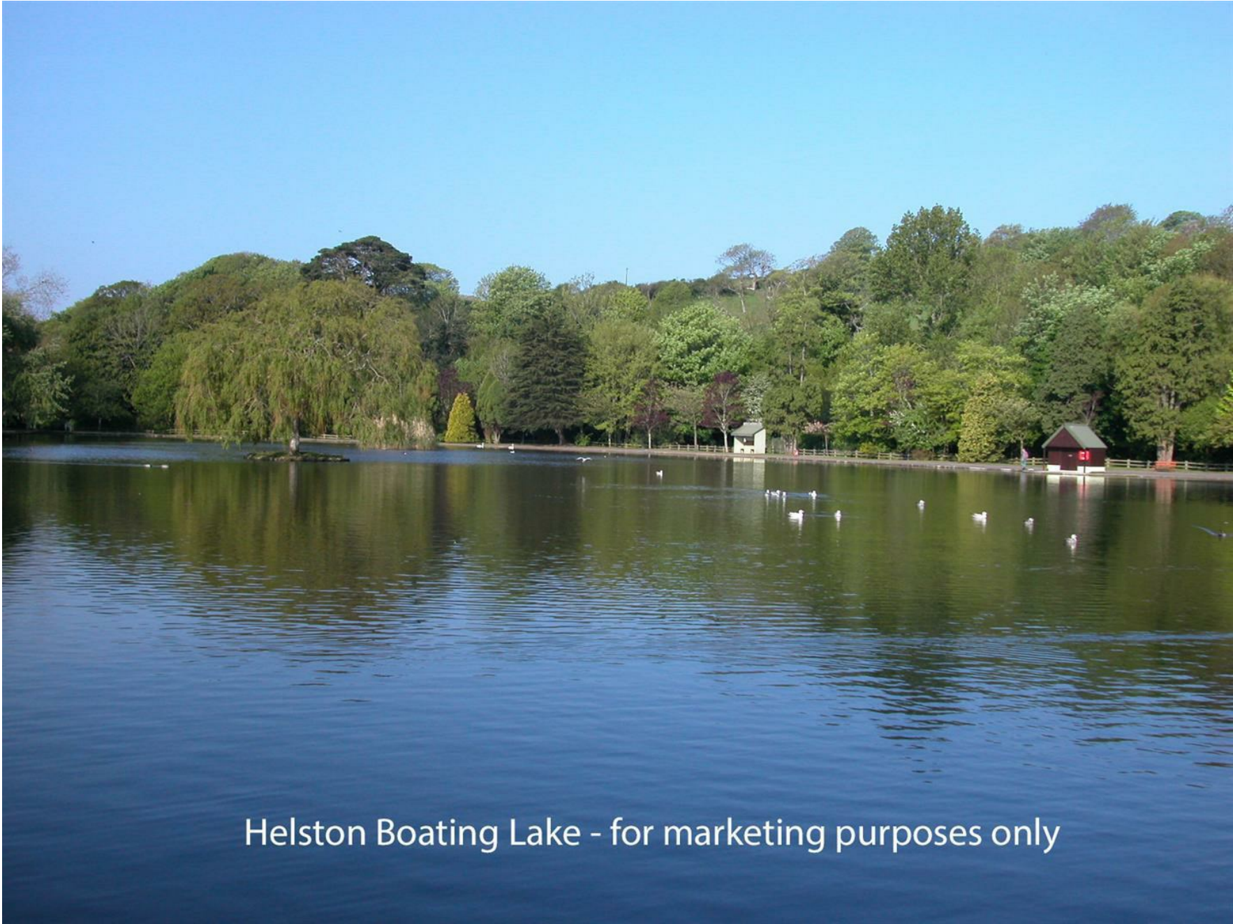
Helston Boating Lake - for marketing purposes only